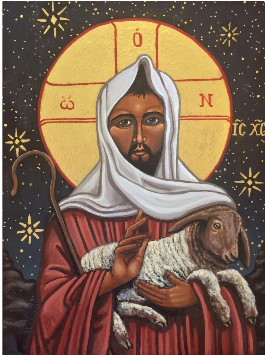
Good Shepherd (2019), Kelly Latimore

https://diglib.library.vanderbilt.edu/act-imagelink.pl?RC=57121